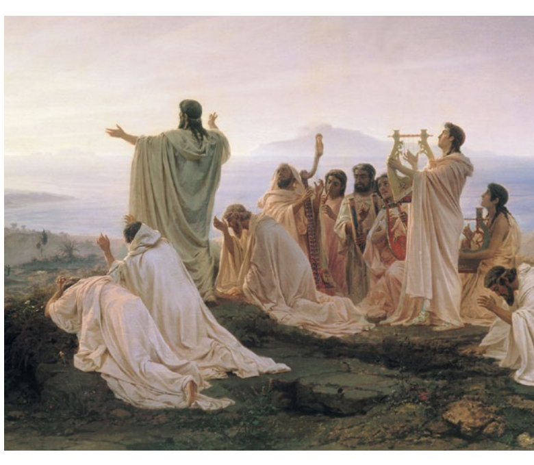
Pythagoreans Celebrate the Sunrise by Fyodor Bronnikov (1869)