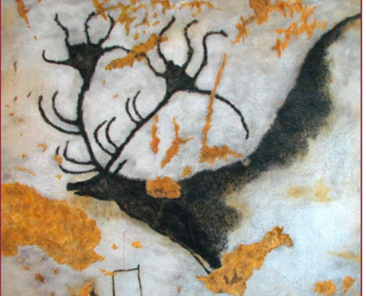
A RT The Oldest Art and the Origins of Humankind