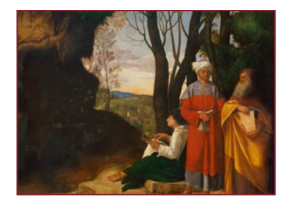
P HILOSOPHY Religion and Philosophy