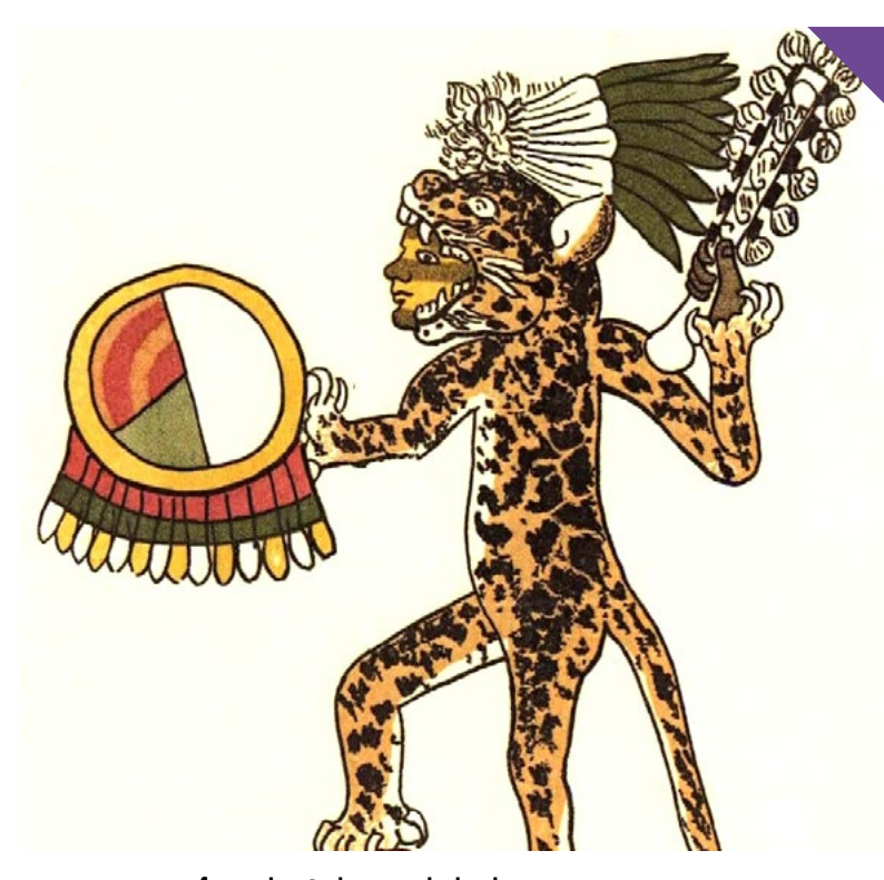
Jaguar warrior, from the Codex Magliabechiano

Nature, signs in nature and dreams played an important role in the way the Aztecs decided to lead their lives. They drew much of their knowledge from nature itself, thus developing a highly elaborate calendar system which was split into a solar calendar