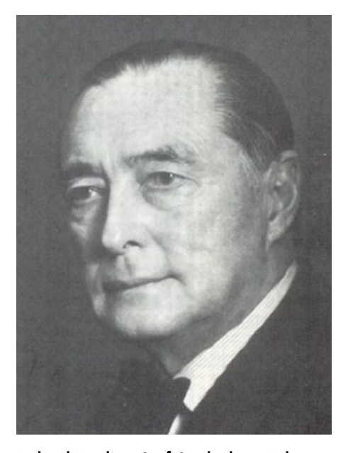
Richard Nicolaus Graf Coudenhove-Kalergi

integration, the Count of Coudenhove-Kalergi (1894-1972), was of the opinion that Britain would have been better off forming a union with its own Commonwealth, guided by its system of Common Law, just as the European Union is guided by its own system of European Law. Whether or not this would still be valid today is another question, but it would be another way of