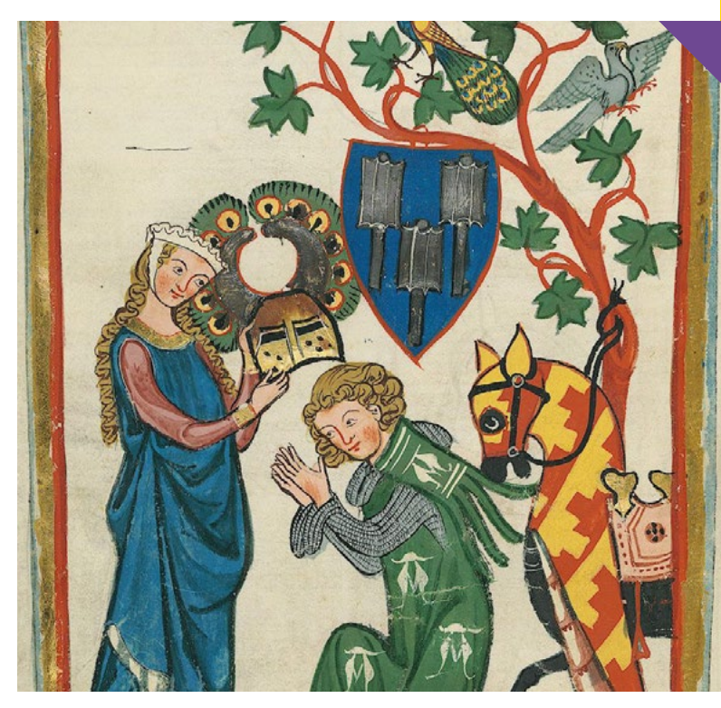
A knight being armed by his lady in the Codex Manesse (14th Century)

The well-known description of events surrounding the sinking of the Titanic depicts the essence of chivalric ideals so universally admired in 19<sup>th</sup> and early 20<sup>th</sup> century Britain: "Gentlemen escorted ladies to the