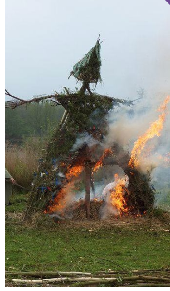
The burning of the Wicker Man forms part of the Beltane festival